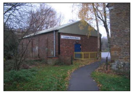
Ref. PAJG 27/11/07

Construction Brick built Pitched metal profile roof finish