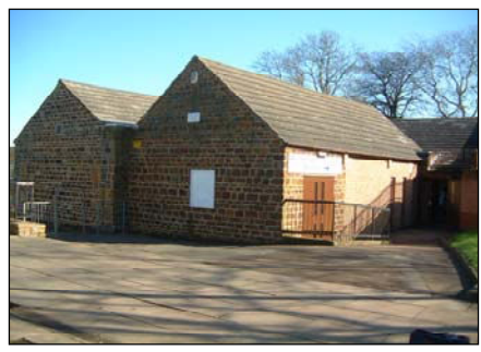
Ref. PAJG 09/11/07

Construction Traditional converted stone barn conversion with 3 pitched roofs and hidden valley.