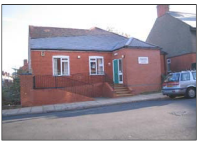
Ref. PAJG 16/11/07

Construction Traditional - Brick , pitched tiled roof with flat felt roof extension to the rear.