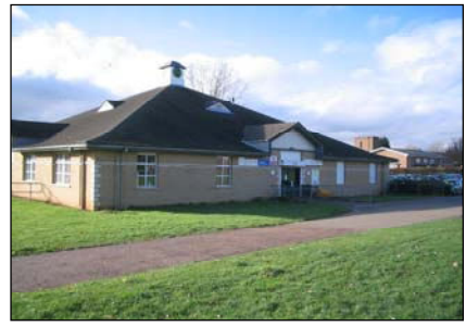
Ref. PAJG 19/11/07

SURVEYOR PAJ Gibbs Land Area 0.0348 Hectares?