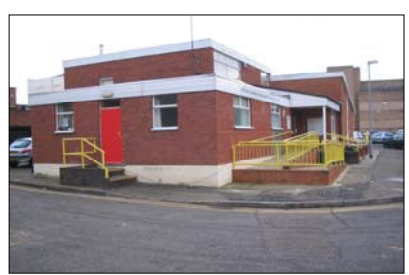
Ref. PAJG 29/01/07

Construction Traditional brick construction with mono pitched and flat roofs