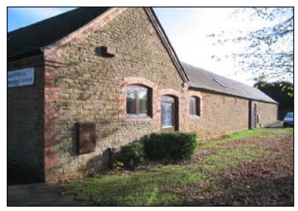
Ref. PAJG 12/11/07

Brick and stone built, with pitched slated roofs incorporating roof lights. Crushed stone surfaced car park. Condition Category Construction