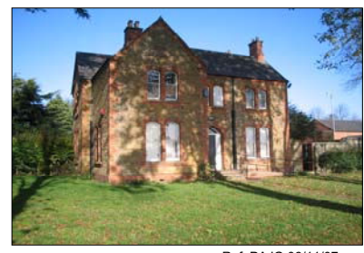
Ref. PAJG 06/11/07

Construction Brick and stone built, with pitched slated roof.