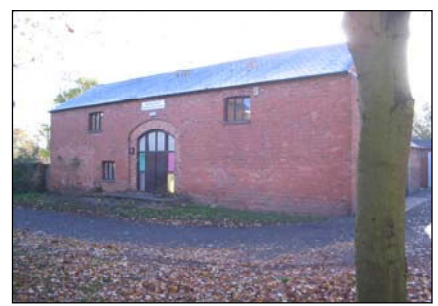
Ref. PAJG 06/11/07

Construction Brick and stone built, with pitched tiled and slated roofs.